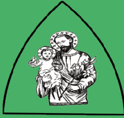
ST. JOSEPH Stanley