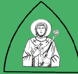
ST. PATRICK Dipton